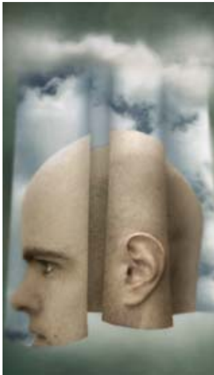
KNOWLEDGE about visual systems is important in the study of consciousness.

It is technically difficult to excite just